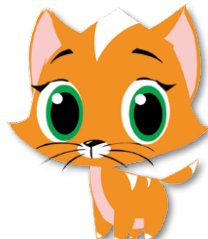
Fluffy the kitten